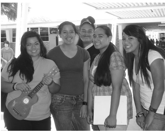
Samoan girls always ready with a smile and a ukelele.

Though Samoans are often mistaken for Hawaiians, there are major differences between the two. For one, while the Hawaiian culture features Hula dancing, Samoans don't even wear grass skirts. In ad-