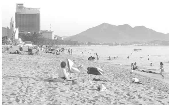
Da Nang Beach, a bustling tourist attraction

It's a jungle in every sense of the word! The heat is blistering, the sun is scorching, and it rains almost every second of every day. Everywhere you